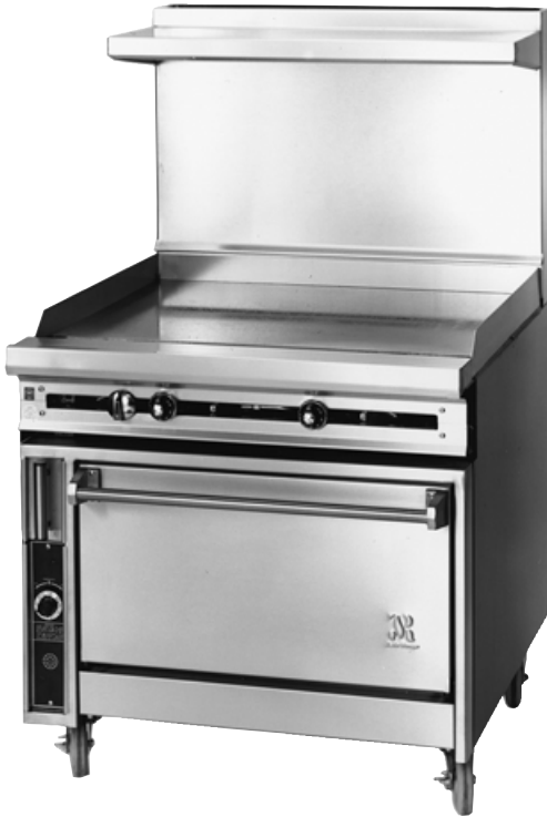
JTRH-36GT-36 with optional high shelf and casters